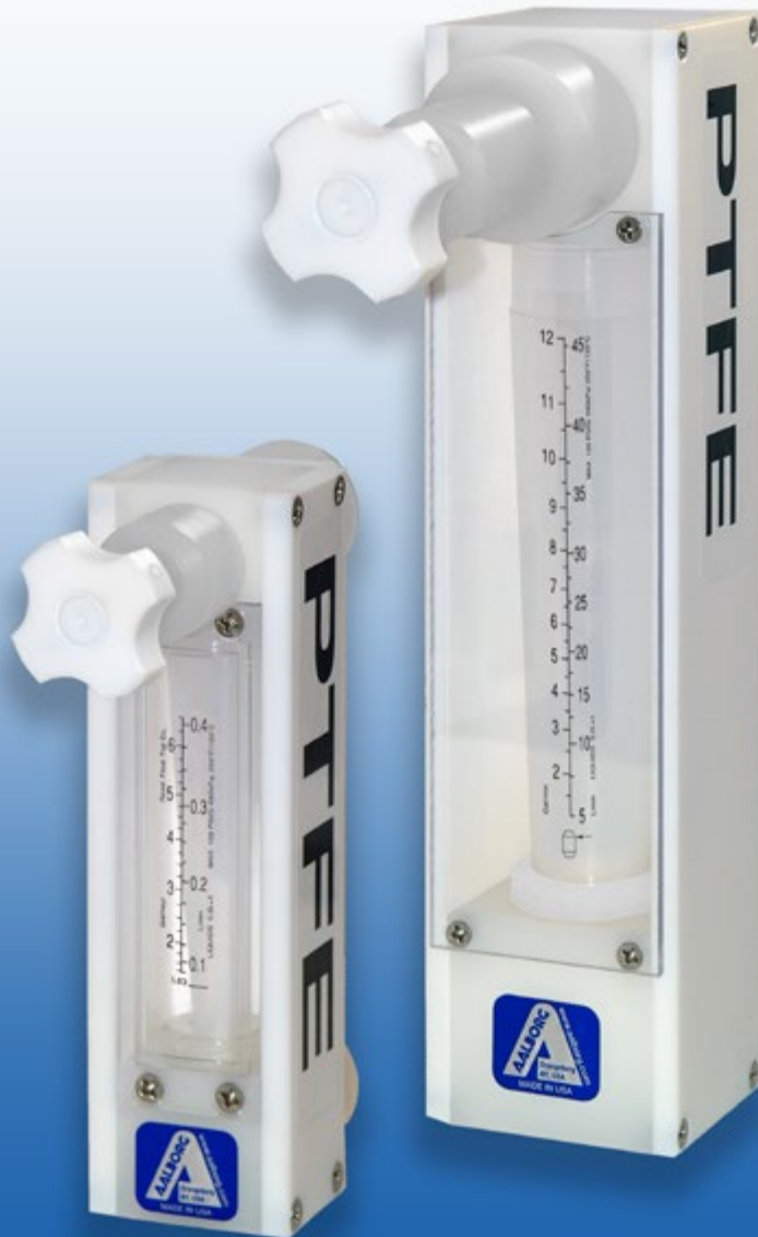
Low Range PTFE meter with Valve