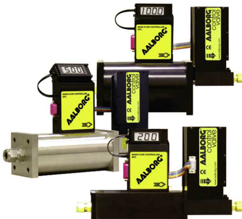
GFC 57, 67 and 77 Series Aluminum and Stainless Mass Flow Controllers