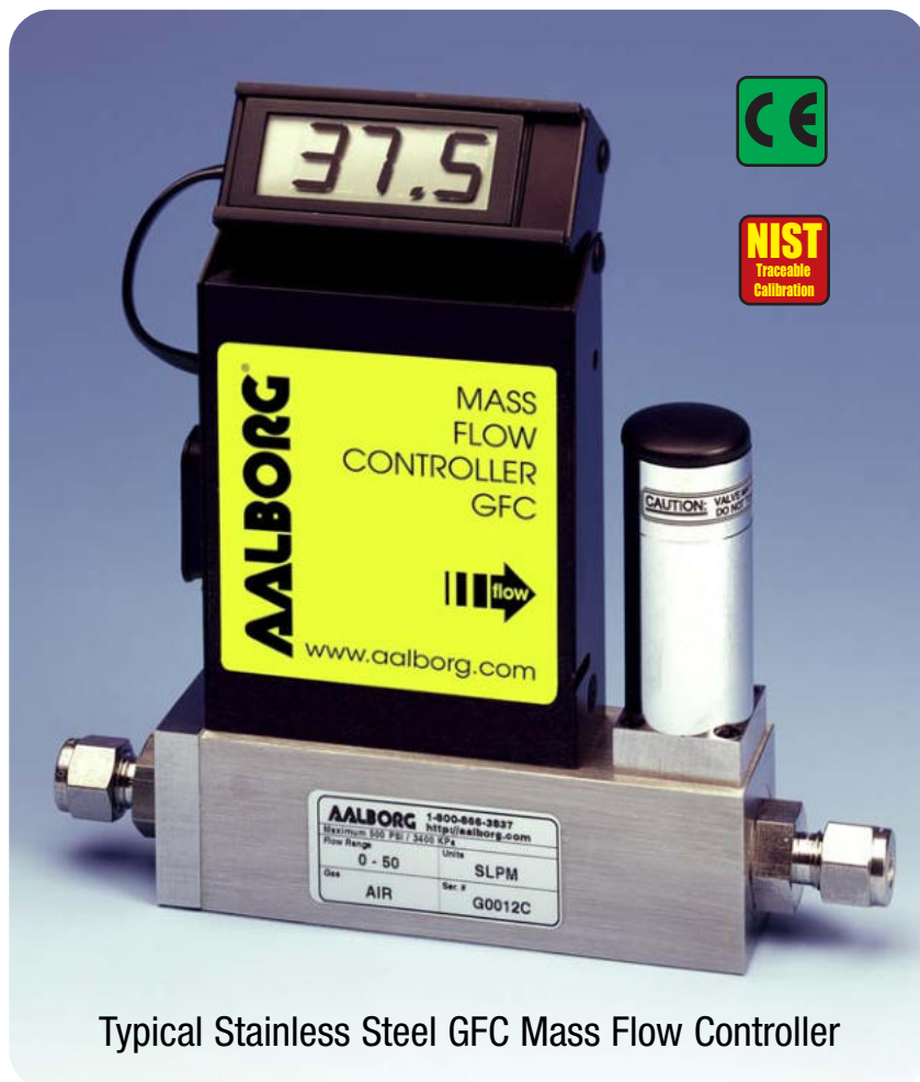
Typical Stainless Steel GFC Mass Flow Controller

Compact, self-contained GFC mass flow controllers are designed to indicate and control flow rates of gases. The rugged design coupled with instrumentation grade accuracy provides versatile and economical means of flow control. Aluminum or stainless steel models with readout options of either engineering units (standard) or 0 to 100 percent displays are available. The built-in electromagnetic valve allows the flow to be set to any desired flow rate within the range of the particular model.